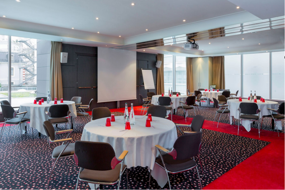
Salon Sausalito, 135m 2